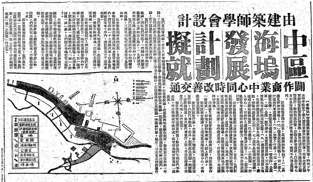
Fig. 3 - Central District development planning by HKIA that balanced walkability and vehicular access (Tai Kung Po, 1960:1).

artistic expression rather than a practical plan. Instead, the present-day examination system emphasizes extensive technical knowledge about regulations and project management. Architects in Hong Kong may indeed have gained “leadership in all matters related to the built and planned environment” (HKIA, 1972, p.10), but perhaps by converging the profession towards what engineers and surveyors can do, while neglecting the development of the design and social consciousness more unique to the role of the architect. While more and more small-/ mid-scale offices with licensed architects are progressively participating in design discourses of the city nowadays, such as One Bite Studio which focuses on placemaking, as well as LAAB that emphasizes fabrication (One Bite Studio, n.d., LAAB, 2022), most architects still take up administrative roles in ‘running projects’ rather than design (Fig. 4). On one hand, this culture results in the marginalization of idealistic design proposals, which are deemed unrealistic. On the other hand, in a city heavily influenced by building codes and developers’ demands, an adminis-