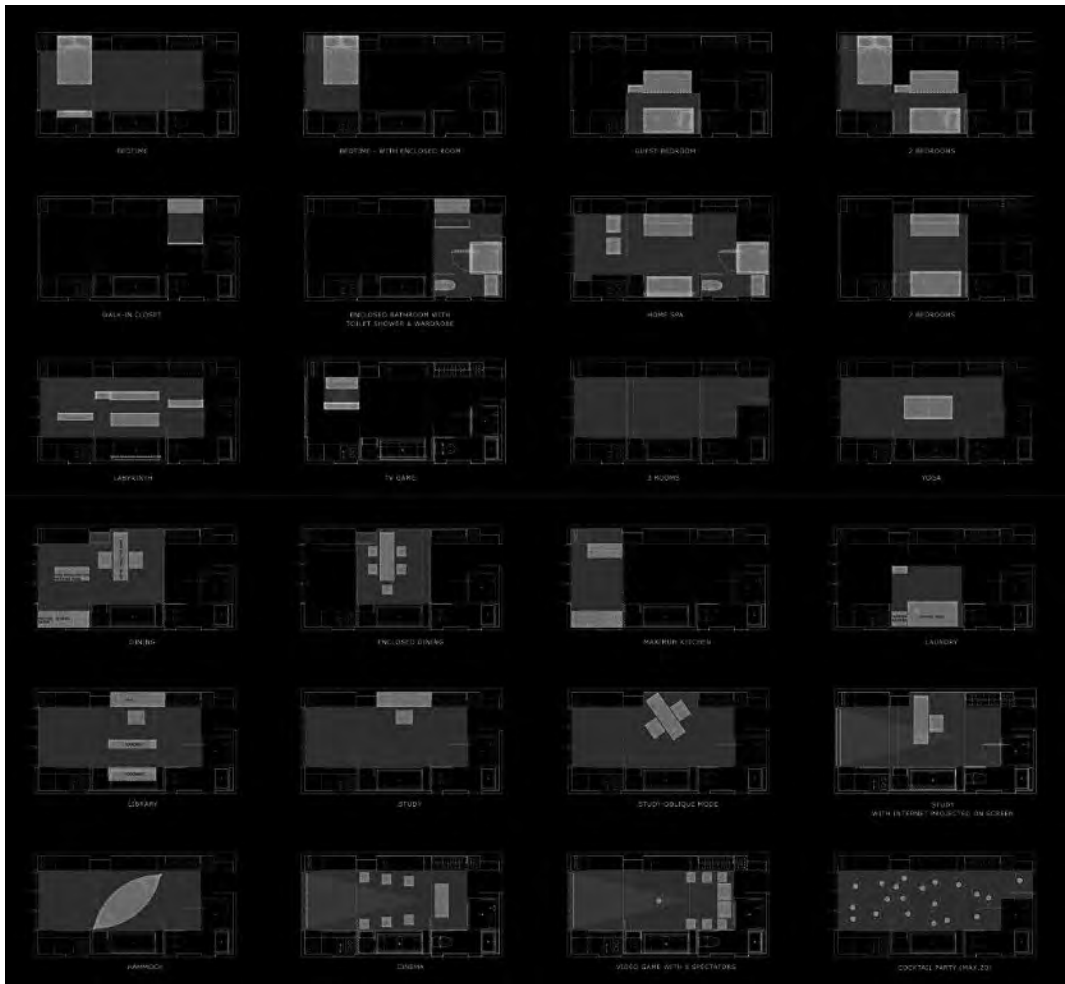
Fig. 3 - The 24 configurations of the Domestic Transformer designed by Gary Chang (2007).

While the frantic pace of transformation profoundly impacts the relationship between time and space in street life, dense public spaces, and congested transportation, domestic units often remain apart from conceptual reflection. The scarcity and high cost of space – and its evolution into a luxury commodity – exacerbate this issue: the expense and limited availability prevent homes from housing an intimate notion of domesticity rituals (Chan and Wong, 2020); however, in Gary Chang’s work, domestic rituals and everyday life experiences re-emerge as rediscovery and design tools.