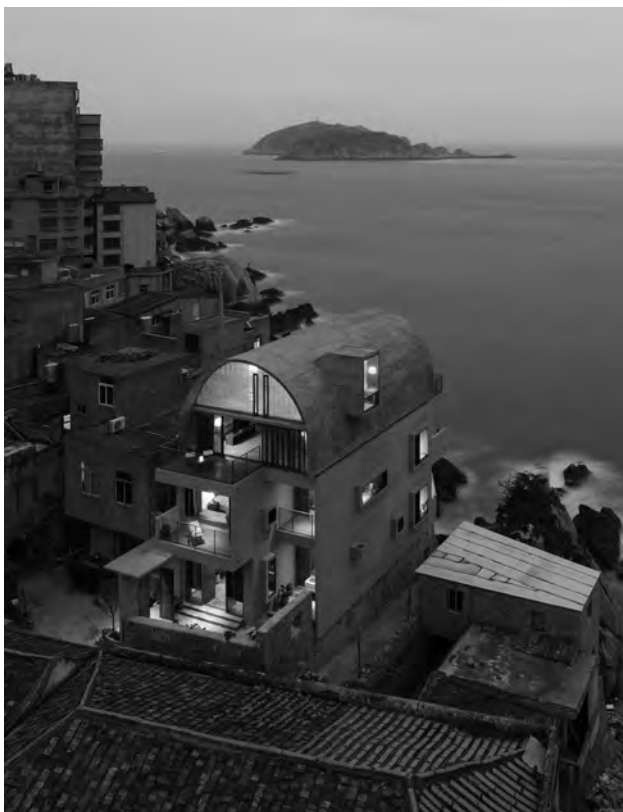
Fig. 6 - The multi-functional concrete vault on the top floor of The Captain's House, designed by Vector Architects (2017).